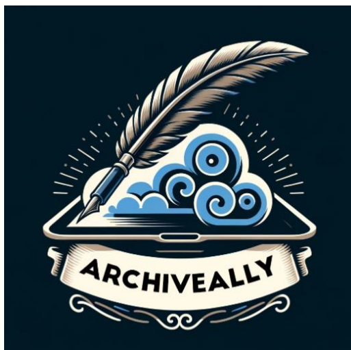
Anonymous, AI tool: DALL-E-3 and Photoshop